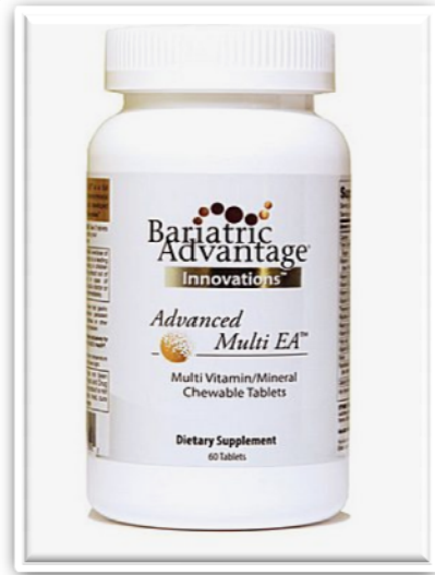
Bariatric Advantage Advanced Multi EA Chewable Multivitamin -- Citrus Flavor