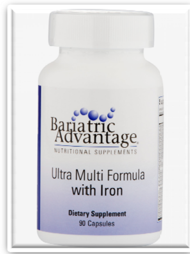
Bariatric Advantage Ultra Multi Formula w/ Iron - Flavorless