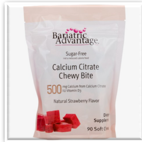
Calcium Chewy Bite Flavors available in 500 mg (1 chew take per dose 2-3 times per day): Caramel, Chocolate, Coconut, Tropical Orange, Peanut Butter Chocolate, Strawberry